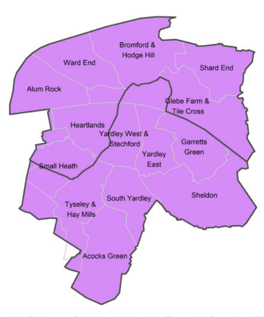
Produced by Birmingham Public Health Knowledge Team (19th September 2023) Contains OS data © Crown copyright and database right 2020.

Figure 1 - Areas of East Birmingham targeted in the research