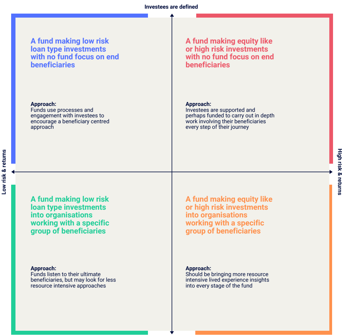
Beneficiaries are defined