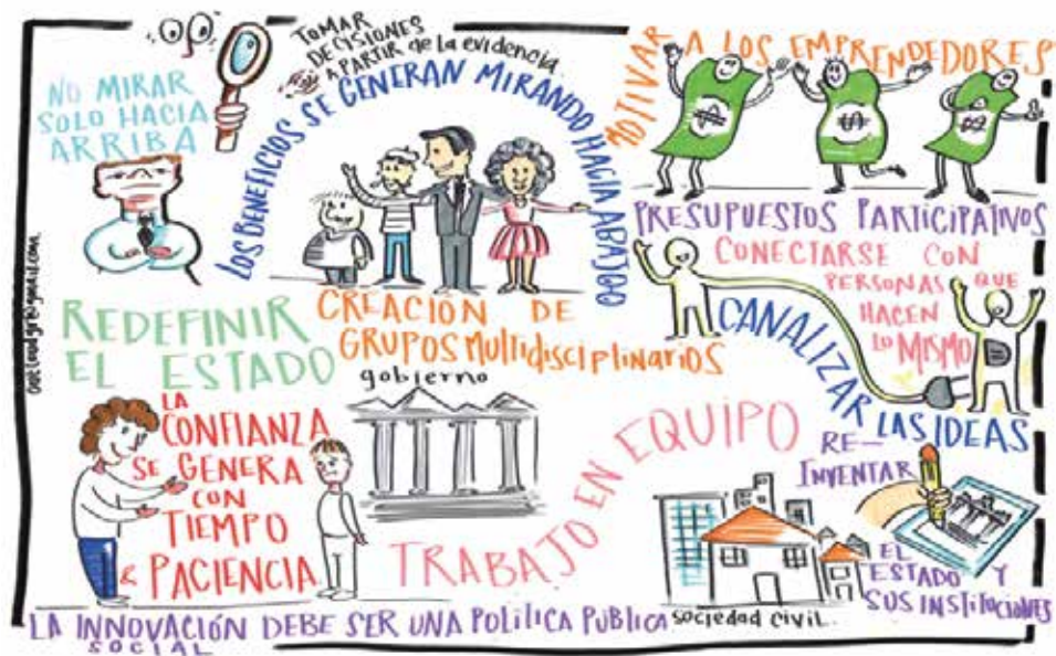
Above: Social Innovation in Practice illustration drawn during 'building momentum for social innovation in Colombia' event

Key examples include Innoweave 28 in Canada, which supports front line staff and practitioners; to the toolkit 29 being developed by Nesta in the UK and Rockefeller Foundation in the US, which brings together effective practical tools for development agencies and organisations who work in this field to use.