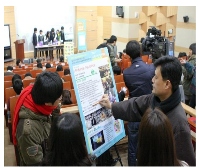
Final presentation at the Suwon City Social Invention Competition 2011.