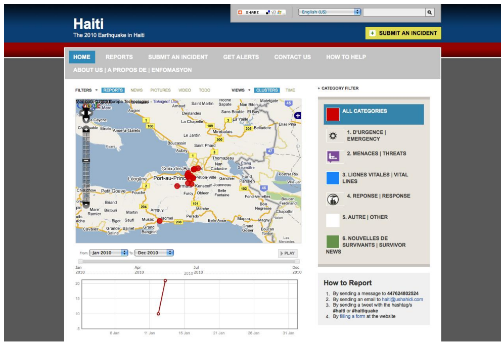
The Ushahidi platform being used in the aftermath of the Haiti earthquake 2010