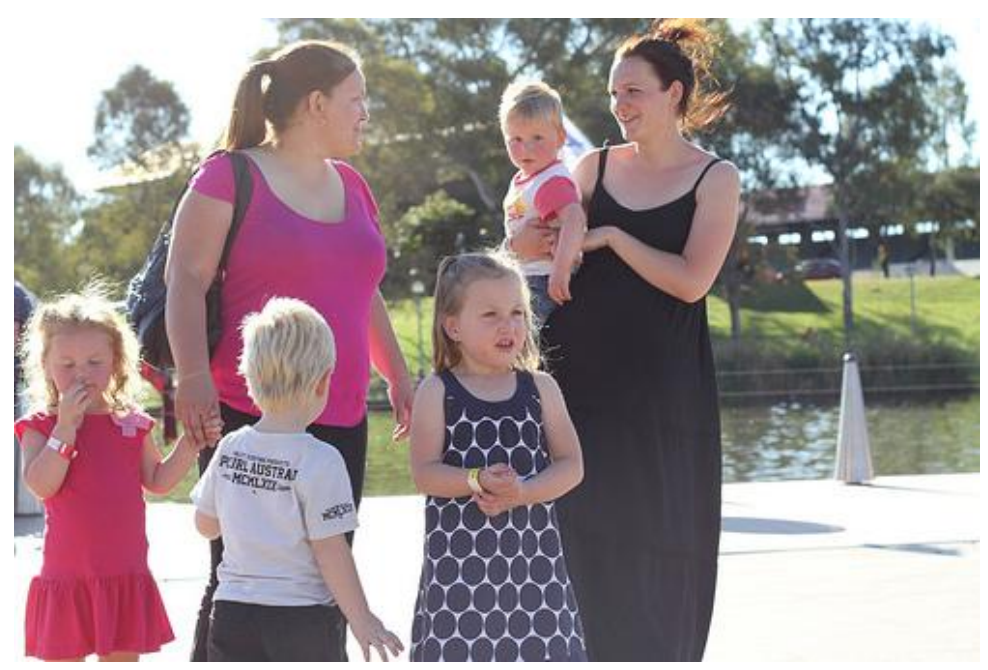
Families who took part in the program