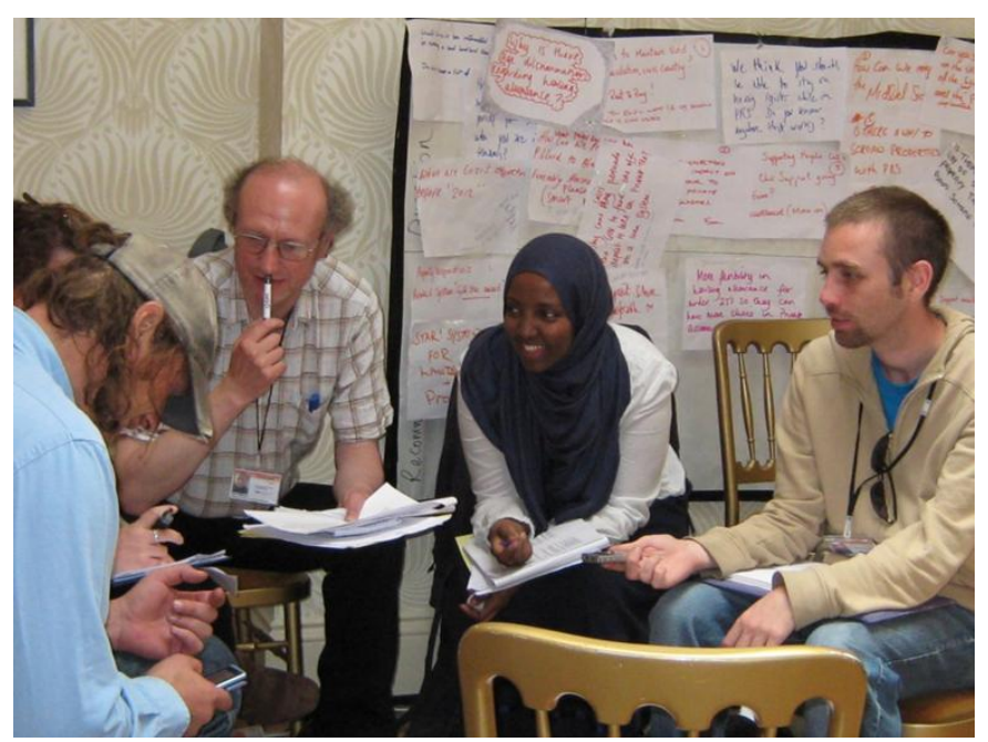
Homeless Peoples Commission in action at Groundswell – image courtesy of Groundswell