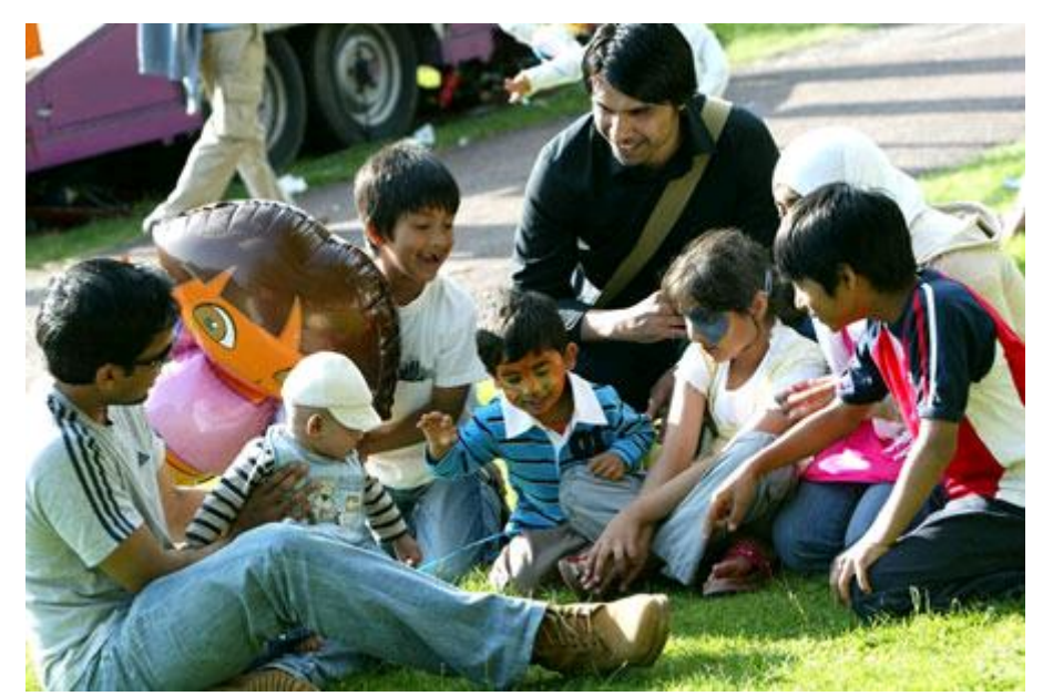
A family learning class selected by Tower Hamlets residents as part of the You Decide! project.