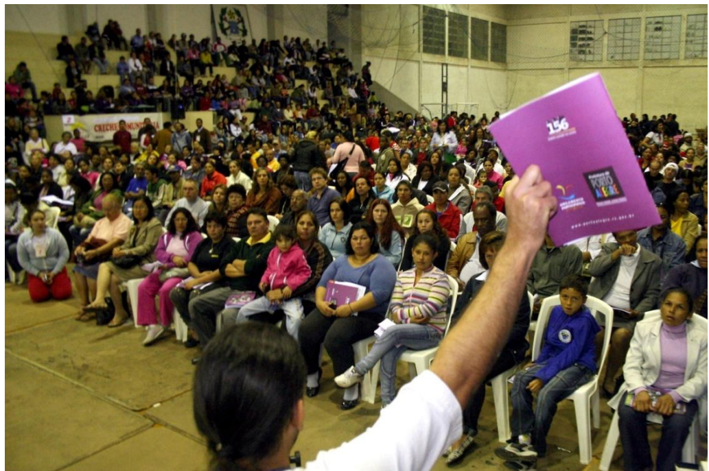
Participatory Budgeting in Porto Alegre.

Participatory budgeting directly involves citizens in making decisions about how public money should be spent. Usually, this means involving citizens in identifying spending priorities, making and voting on proposals about how to spend the budget, and then involving citizens in overseeing and evaluating how the money was spent. The practice emerged in the 1980s in Porto Alegre, Brazil and has since been adopted in many cities and regions around the world, albeit in very different forms.