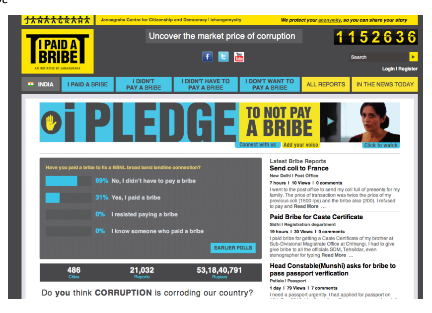
The I Paid a Bride platform.

I Paid a Bribe is an online platform developed by non-profit group Janaagraha that harness the collective energy of citizens to tackle corruption in public services in India. The aim is to understand the scope and scale of corruption by gathering data, to create a network of support and a space where people could share individual stories and experiences, to expose corruption and to use the data to uncover trends, call for changes and gradually eliminate opportunities for corruption altogether. Citizens provide reports about bribes they paid, bribes they resisted and instances where they received a public service without paying a bribe. There is also a 'bribe hotline' for people to ask advice about how to avoid paying a bribe. The information collected through the site is then used to advocate changes in governance and accountability processes. Janaagraha produces citizen reports (to help citizens avoid bribery) and reports for government agencies (which identify particularly corrupt teams or departments within public institutions and often contain recommendations for reforms to rules and procedures). The site has now been replicated in Pakistan, Kenya, Greece and Zimbabwe.