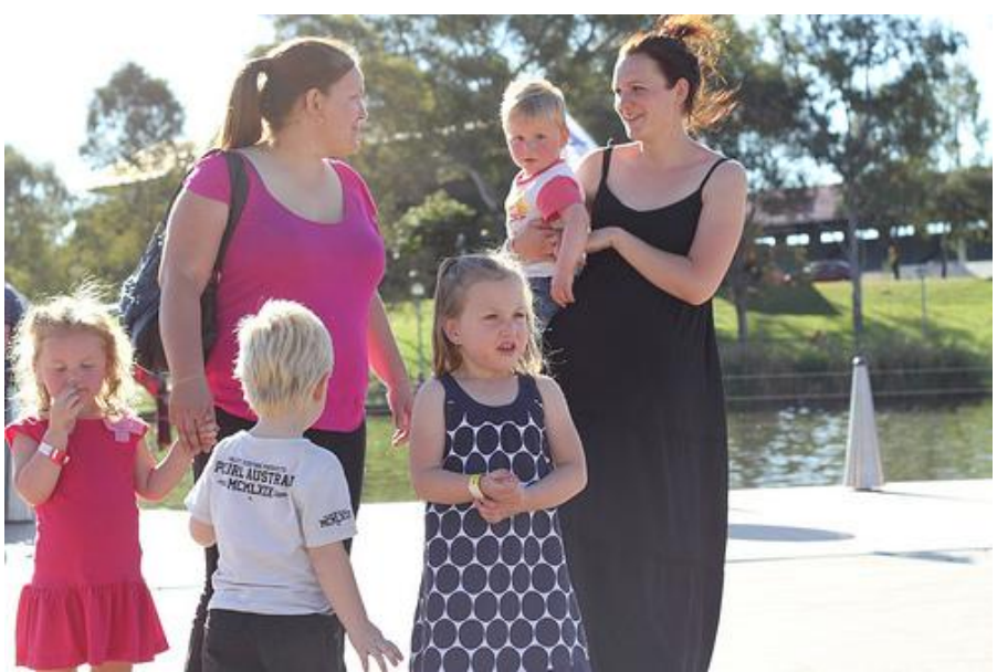
Families who took part in the program

Family by Family is a new model of family support co-designed with families in South Australia that aims to enable more families to thrive and fewer to come into contact with crisis services. The programme works by finding, training and resourcing families who have overcome tough times (known as 'sharing families') and connecting them with families who want things to change (known as 'seeking families'). Once families have been matched they take part in 'link up' activities for between 10 and 30 weeks. Sharing families are supported in their role by weekly coaching sessions and are given a grant (which they can spend on link-up activities, their own families or donate back into Family by Family) in recognition of the intensity of the support they provide. In this model, professionals act as brokers to these family interactions rather than delivering services.