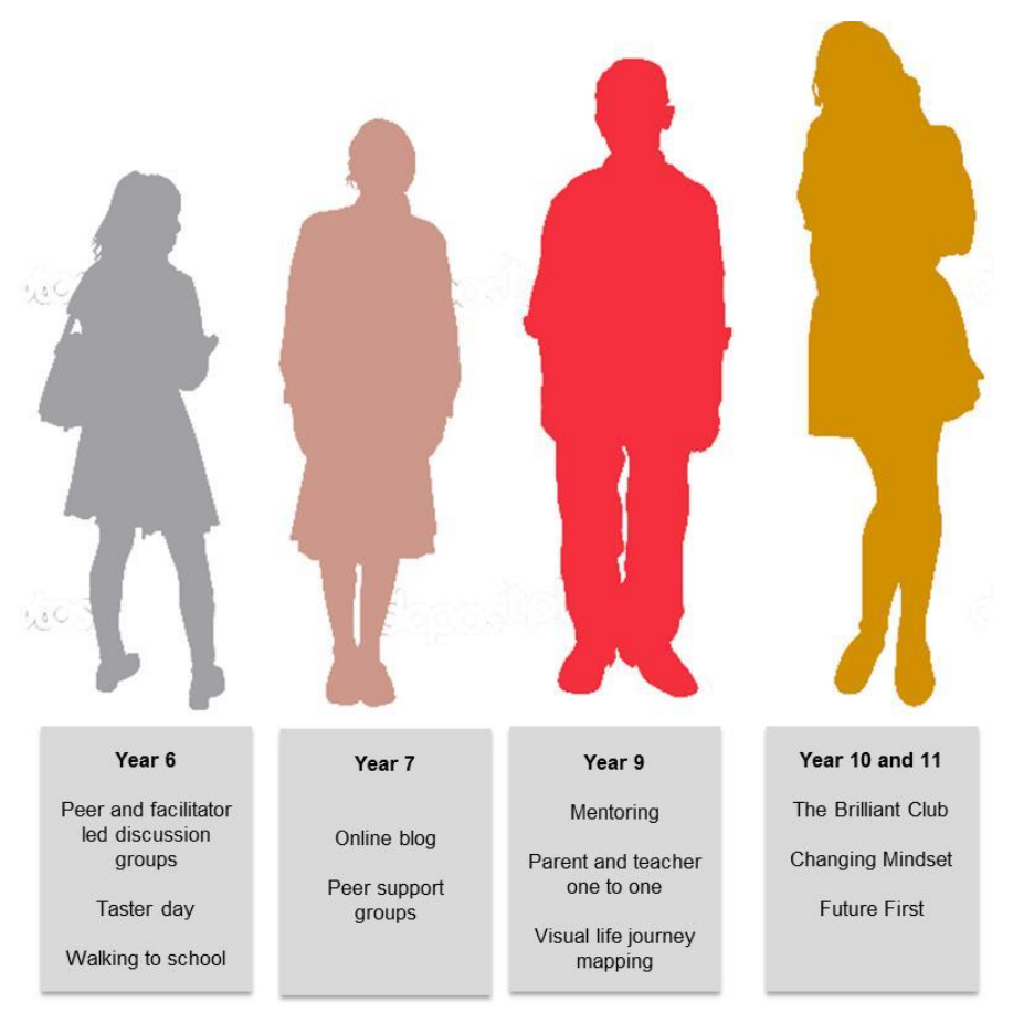
Figure 1: Activities to support transition from Year 6 to Year 11