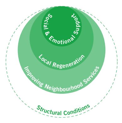
Figure 2: Strategic approaches to tackling local deprivation (the Young Foundation)