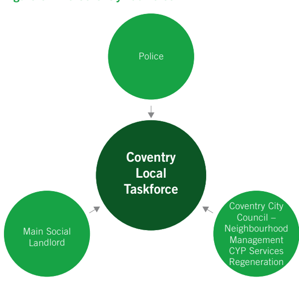
Figure 5: The Coventry Taskforce

Agencies and residents identified the estate has problems. Some are due to administration and management, and others stem from deep-rooted family and community-based issues but they are inextricably linked. A sense of pride and ownership by residents is needed to maintain environmental improvements, and that in turn depends on tackling the more complex problems facing residents. Attitudes to education and lack of aspiration, particularly in young people, reinforce the estate's reputation. But there is potential; levels of social capital are relatively high and although social networks exert both positive and negative influences, the opportunities exist to build on these.