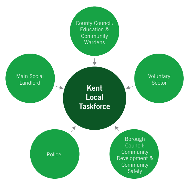
Figure 4: The Kent Taskforce

Overall, there is a sense among agencies and residents that the estates are troubled. Agencies describe how residents present themselves as happy with their lives, but under the surface there is a sense of discontent that they do not know how to articulate.