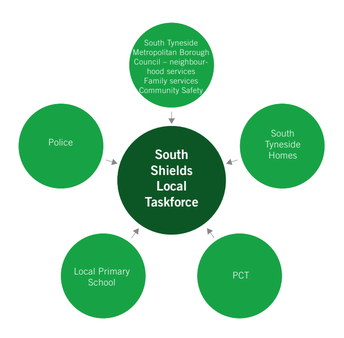
Figure 6: The South Shields Taskforce

The settled nature of many of the inhabitants of the estate and local family and social networks are an asset for the area and helps to contribute to this warm sense of community. Whilst community involvement in the wider area is improving, there is little community activity within the estate, aside from a small emerging group of residents. Given the right support, resources and opportunities, there are residents who would put themselves forward to be involved in tangible activities for change.